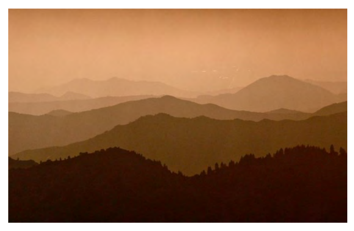
A view of Moro Rock in Sequioa National Park.

Always plugged in and constantly juggling tasks at work and at home, many of us feel there aren't enough hours in the day.